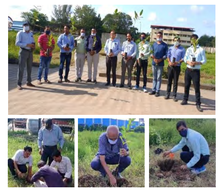
Planted over 500 trees at manufacturing units and schools