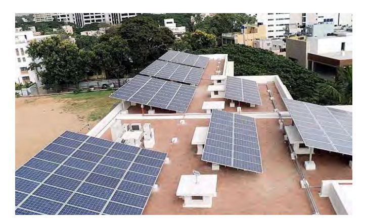
Installed Solar Panels at Surangi Unit to reduce Carbon Emissions per month