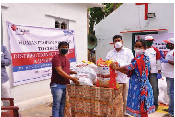
Distributed 2000 Ration Kits among under privileged people and workers during the pandemic