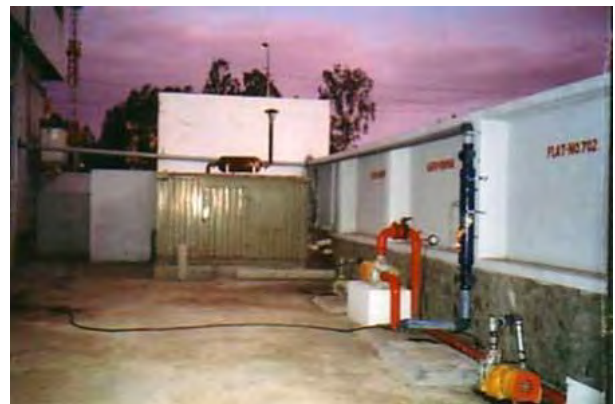
Harvesting facilities at units