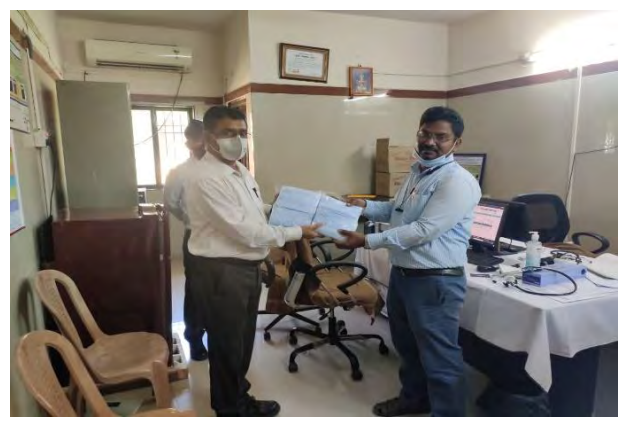
Provided 2000 masks to villagers and medical staffs